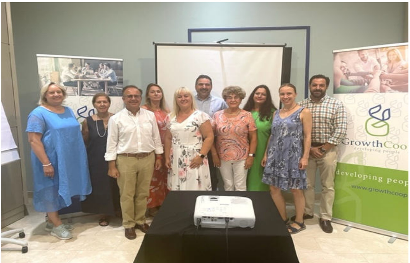
The transnational team working on project results in Granada

Project No. 2021-1-LT01-KA220-ADU-000035360